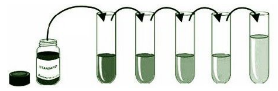
270 pmol/ml 180 pmol/ml 120 pmol/ml 60 pmol/ml 30 pmol/ml 15 pmol/ml

total volume in all the wells are 50\mu l and the concentrations are 180 pmol/ml, 120 pmol/ml, 60 pmol/ml, 30 pmol/ml, 15 pmol/ml)